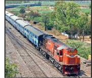
Ananditha Mankotia @timesgroup.com

New Delhi: Union Minister of Railways Piyush Goyal is scheduled to apprise Prime Minister Narendra Modi on the progress of the crucial Bilaspur-Leh railway line on Saturday, people familiar with the matter said. The Bilaspur-Leh line seeks to significantly expand access to projects as well as support movement of troops and equipment to border areas, boosting Jammu and Kashmir's connectivity with the rest of the country. Goyal's presentation will include newer deadlines for freight corridors, fast tracking bullet trains, revenue shortfall on account of the Covid-19 pandemic, station redevelopment, ways to mop up additional revenue to keep railways afloat and private investment in various railways projects, the people said. "The meeting is scheduled for Saturday morning and it will include a presentation by the minister on crucial projects, revenue condition of railways, other important matters in railways," one of the people told ET. "Railway cadre merger is another crucial area which the minister is expected to take up," the person said. Goyal has said previously that the Covid-19 virus outbreak had altered timelines and deadlines for completion of projects. The ministry was, however, expediting the project and had gone ahead with the land acquisition procedure in Himachal Pradesh, the people who are in the know of developments said.