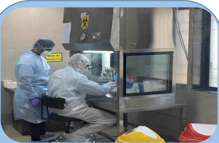
Covid-19 Healthcare Projects