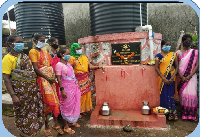
Solar Water Project