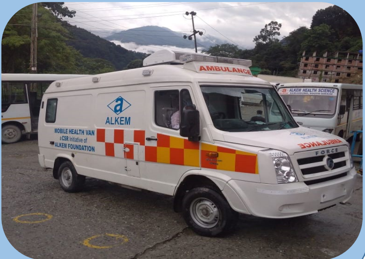
Preliminary Health Services