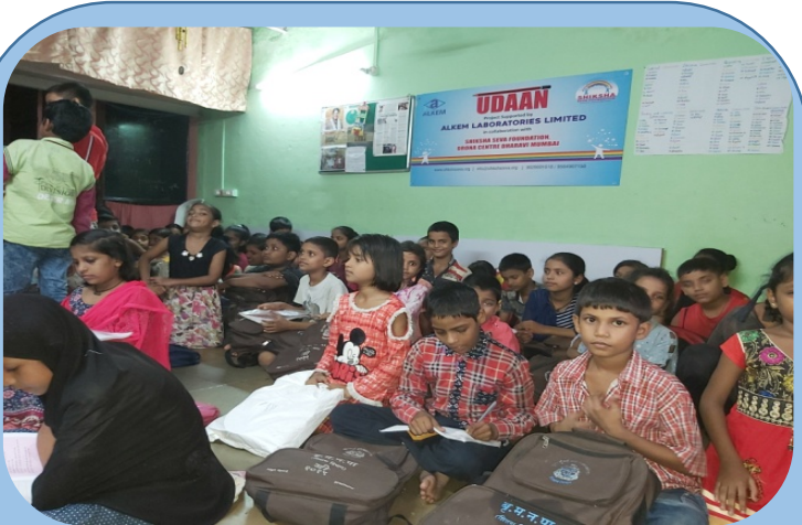
Education for Remedial Children