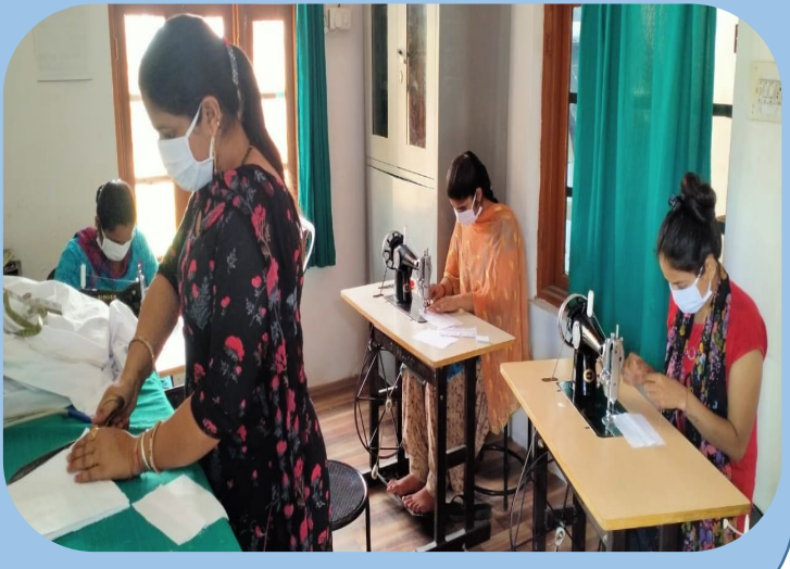
Skill Development Program