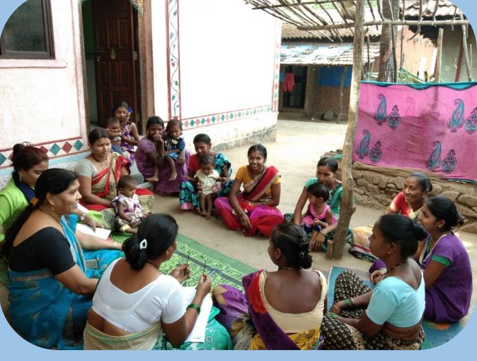
Mother and Child Healthcare